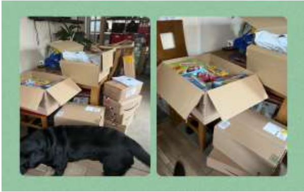
Wish List Requests

Staff can submit a wish list to the PTA to make a request for equipment or resources. Items that have been requested & purchased have been for games, jigsaws, construction, role play, sensory items, outdoor games, a bench for the outdoor learning area and a sensory corner, plus more.