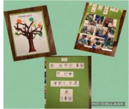
Thank You cards for the PTA